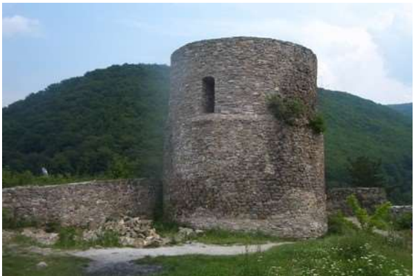
The remains of the castle from XIV th century situated in Rytro

NOWY SĄCZ / RYTRO SEPTEMBER 18 – 21, 2016 ANNOUNCEMENT No 1